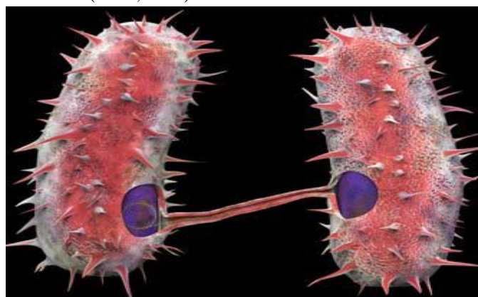
Figure1. Conjugation

Plasmid which is a round chunks of bacterial DNA that exist naturally internal many bacterial cells, may also include genes that confer antibiotic resistance. The plasmids are spread to other bacterial cells by using specific mechanisms such as transformation, transduction, conjugation and transposition. Transformation of genetic cloth occurs when a bacterium dies, at which factor it breaks up and releases its DNA into its environment. Nearby micro organism can choose up bits of this free floating DNA and integrate it into their very own genomes, growing a manageable pathway for antibiotic resistance dissemination. Transposition is when a section of DNA that has a repeat of an insertion sequence thing at each quit that can migrate from one plasmid to every other within the identical bacterium, to a bacterial chromosome, or to a bacteriophage. The mechanism of the transposition seems to be independent of the host's normal recombination mechanism. Conjugation is when two micro organism are close to each other, genetic fabric can be surpassed at once between cells, or by way of a hollow shape called a pilus, or a pore, that can structure between the two cells. Plasmids can use this pilus like a bridge, sending copies of themselves to the other cells (SGM, 2015).