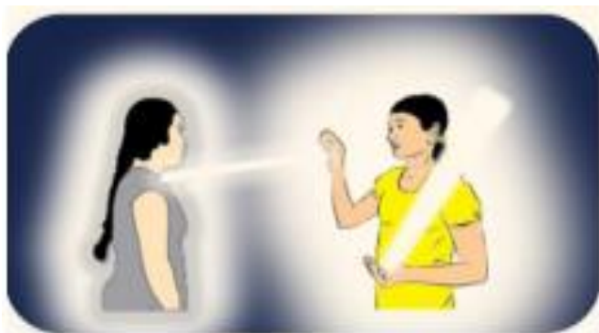
Fig 1. Shows channelling of energy from the healer to the patient

Yoga Prana Vidya (YPV) is a no touch and a no medicine proximal or distant healing modality which is based on the principle that our body has the ability to heal itself or normalise itself and this process can be accelerated, if the flow of prana or energy in our system is regulated. It is complimentary in nature and does not intend to replace other forms of healing modalities. YPV is a holistic and an integrated healing modality which uses breathing exercises, forgiveness sadhana, meditation techniques, physical exercises and energy healing to cure any physical or psychological ailments.